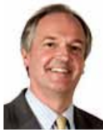
Paul Polman Chief Executive Officer Unilever

Paul Polman became an Executive Director of Unilever in October 2008 and assumed the role of Chief Executive Officer in January 2009.