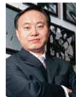
Dr Shi Zhengrong Chairman and CEO Suntech Power