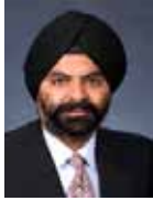
Ajay Banga President and Chief Executive Officer MasterCard Worldwide

Ajay Banga joined MasterCard as President and Chief Operating Officer in August 2009 and was appointed Chief Executive Officer of the company in April 2010, effective from July 2010. He is also a member of the board of directors.