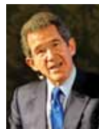
Lord Browne of Madingley Chairman The Performance Theatre