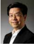
Dr Kai-Fu Lee Chairman and Chief Executive Officer Innovation Works

Kai-Fu Lee founded Innovation Works in 2009 as a business-creation platform geared to producing the next wave of Chinese high-tech companies and mentoring the next generation of Chinese entrepreneurs. The company is particularly focused on internet, mobile internet, and cloud computing technologies.